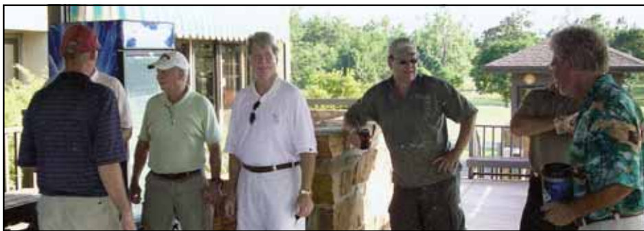
The group at the 19th hole