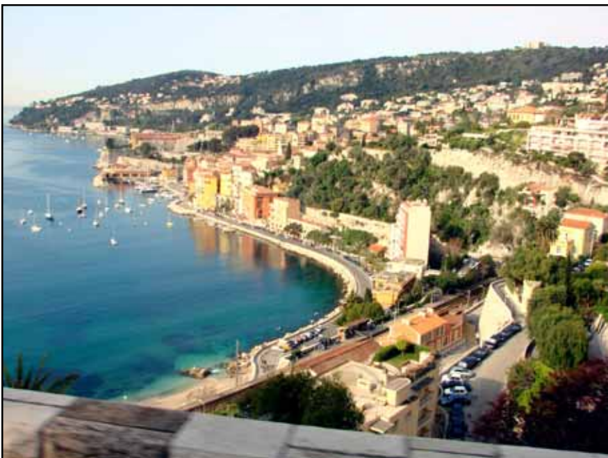
French Riviera - View from Monte Carlo