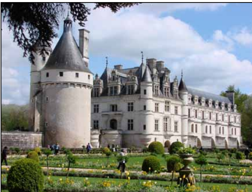
Château de Chenonceau in the Loire Valley

Our hotel for the next three nights was modern and located in the town of Annecy. All 30 of us enjoyed a guided cruise on the lake the next morning before taking an adventurous walking tour along the foot bridges of the Gorge du Fier, an impressive canyon along the Fier river. The next morning offered beautiful panoramic views of the Alps and Mont Blanc en route to Thônes, as we toured