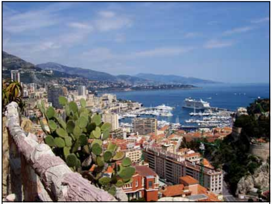
Exotic Gardens overlooking the Mediterranean Sea