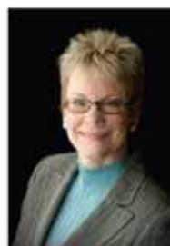
Citigroup Global Markets Inc.

*10% Discount for Tulsa Ski Club Members