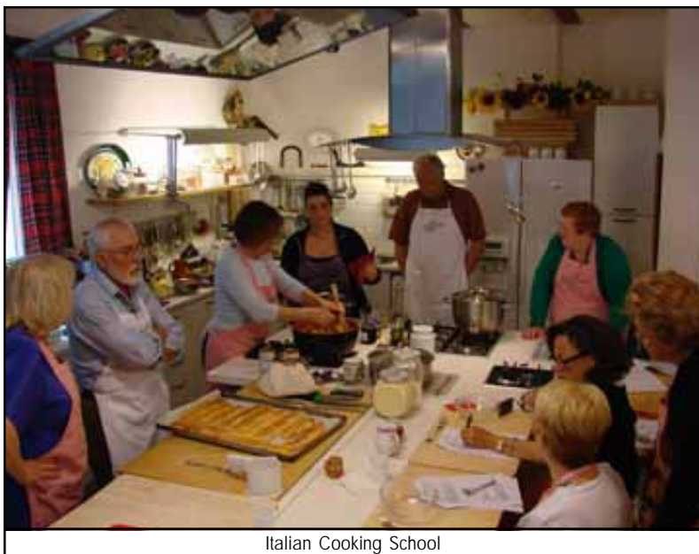
Italian Cooking School

During our stay in Siena, our hotel was host to an Italian Mercedes Owners Car Club. About 40 classic Mercedes