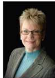
Citigroup Global Markets Inc.

*10% Discount for Tulsa Ski Club Members