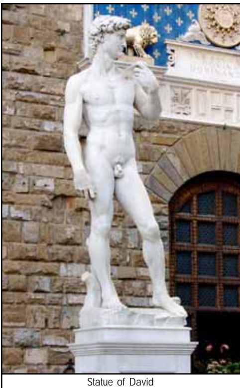
Statue of David