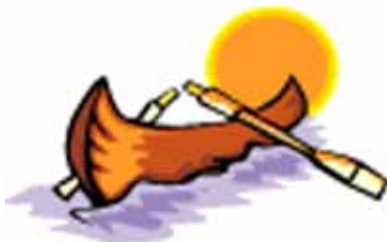
Adult Canoe Trip